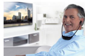
Freedom of movement